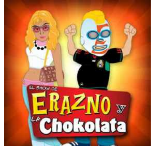
Billboards #1 Entertainment Show